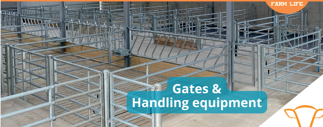
Gates & Handling equipment