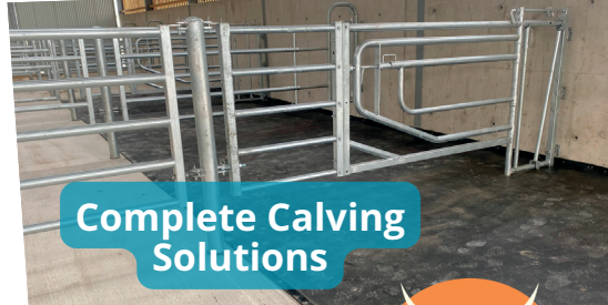
Complete Calving Solutions