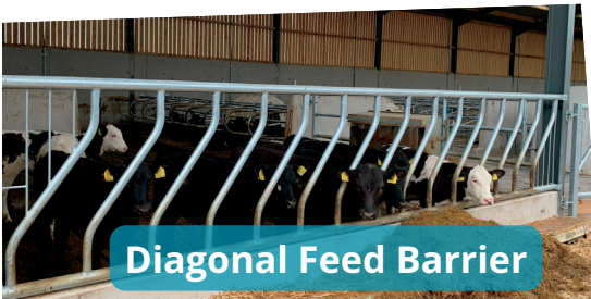
Diagonal Feed Barrier