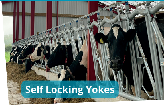
Self Locking Yokes